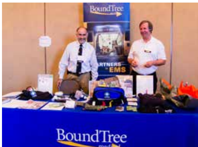
EXHIBIT SPACE ONLY .... $750 for Members $1,150 for Non-Members