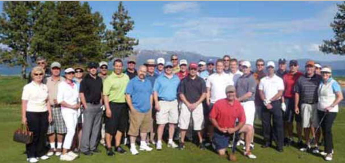
The CAA Annual Convention gets started with the Raymond Lim Memorial Golf Tournament at the Edgewood Golf Course.

There's still time to register for the CAA's 63rd Annual Convention, June 15-17, 2011 at Harrah's Lake Tahoe in Stateline, Nevada.