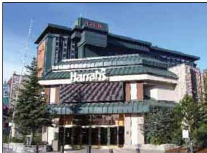
The CAA Annual Convention will be held at Harrah's Hotel in South Lake Tahoe.

Festivities kick-off on Wednesday, with the Raymond Lim Memorial Golf Tournament, held at the beautiful Edgewood Golf Course, along the shoreline of Lake Tahoe. Edgewood is rated by Golf Digest as one of "America's Top Golf Courses."