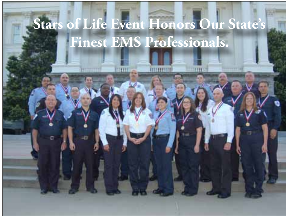
This year's Stars of Life event honored twenty-seven EMS workers from across the state of California.

Twenty-seven EMS professionals from across the state were honored as Stars of Life at the State Capitol in April. Their actions, whether from a single, life-saving event or a career of exemplary performance demonstrate they are amongst the best of California's ambulance providers.