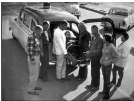
Citizens wanting to improve pre-hospital care in their community formed Sierra Ambulance in 1964.

Through the years, Sierra Ambulance has played an active role in serving its community outside of delivering first rate emergency and non-emergency medical transportation services. The ambulance service offers community CPR instruction, a junior paramedic program in the schools and various EMS awareness programs in the community. Sierra