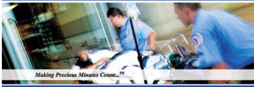
Making Precious Minutes Count.™