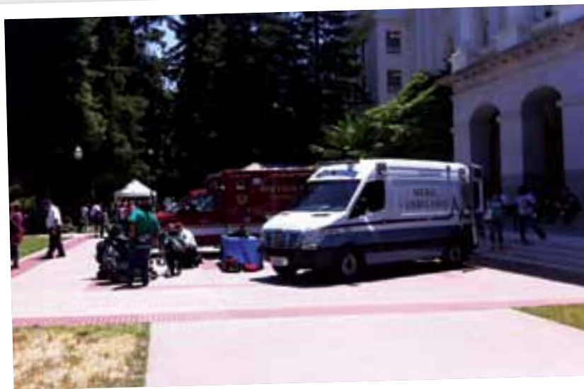
CPR Day on the steps of the Capitol.

National Emergency Medical Services (EMS) Week was held May 20-26, 2012 and brings together local communities and medical personnel to honor the dedication of those who provide the day-to-day lifesaving services of medicine's "front line." *